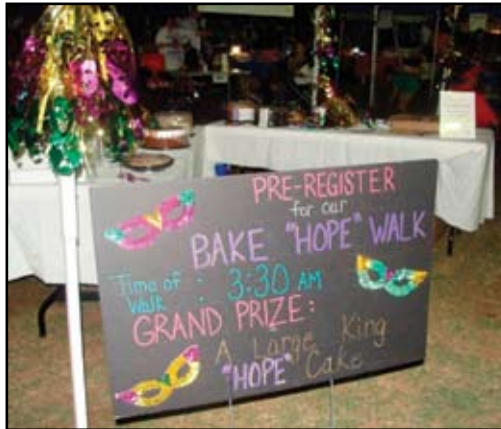
The credit union sponsored a cake walk at 3:30 a.m.