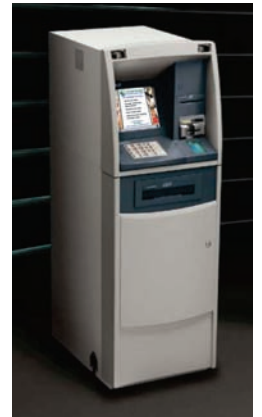
New Cash Dispenser at IP

We continue to work diligently to improve our products and services to serve you better!