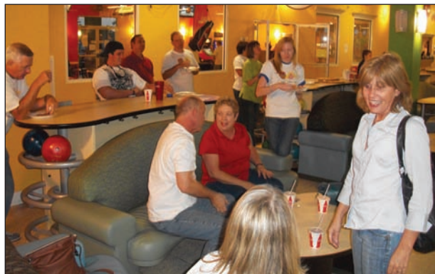
Credit union staff and family members enjoyed pizza in between striking the pins.