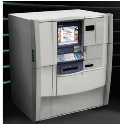
New ATM at Lathrop Ave. office and in Georgetown

Through advanced ATM technology, you can now deposit both cash and checks without an envelope. Conducting your deposits without using a deposit envelope offers faster transactions at the ATM, the convenience of banking at any time of the day without having to wait in line, and